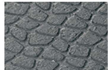
grip-surface: supports sure footing