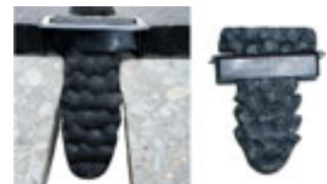
fastening element: patented rubber peg to prevent lateral slipping - flush with the mat