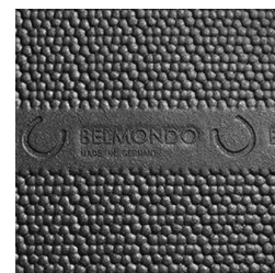
proven pebbled profile on upper side